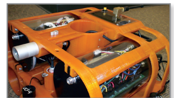
Image 3: The frame was first prototyped, then manufactured from ABSi using the same Fortus FDM system.